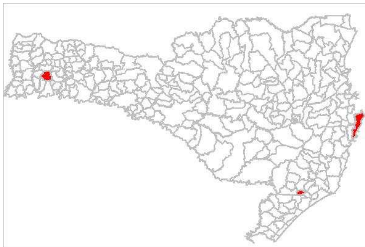
Figure 1. Starting point of maintenance teams in the State of Santa Catarina.

Epagri have agreements with several institutions in the State of Santa Catarina that guaranteed the installation of 50 Pluviologgers in an area of 95.442 km 2 . The equipment demands monthly preventive maintenance, what makes impracticable the use of only one maintenance team due to the fact that the Headquarters of Epagri is situated in the Capital (extreme east of the State). Currently three teams are responsible for the maintenance of all equipment, which are distributed according to the Figure 1.