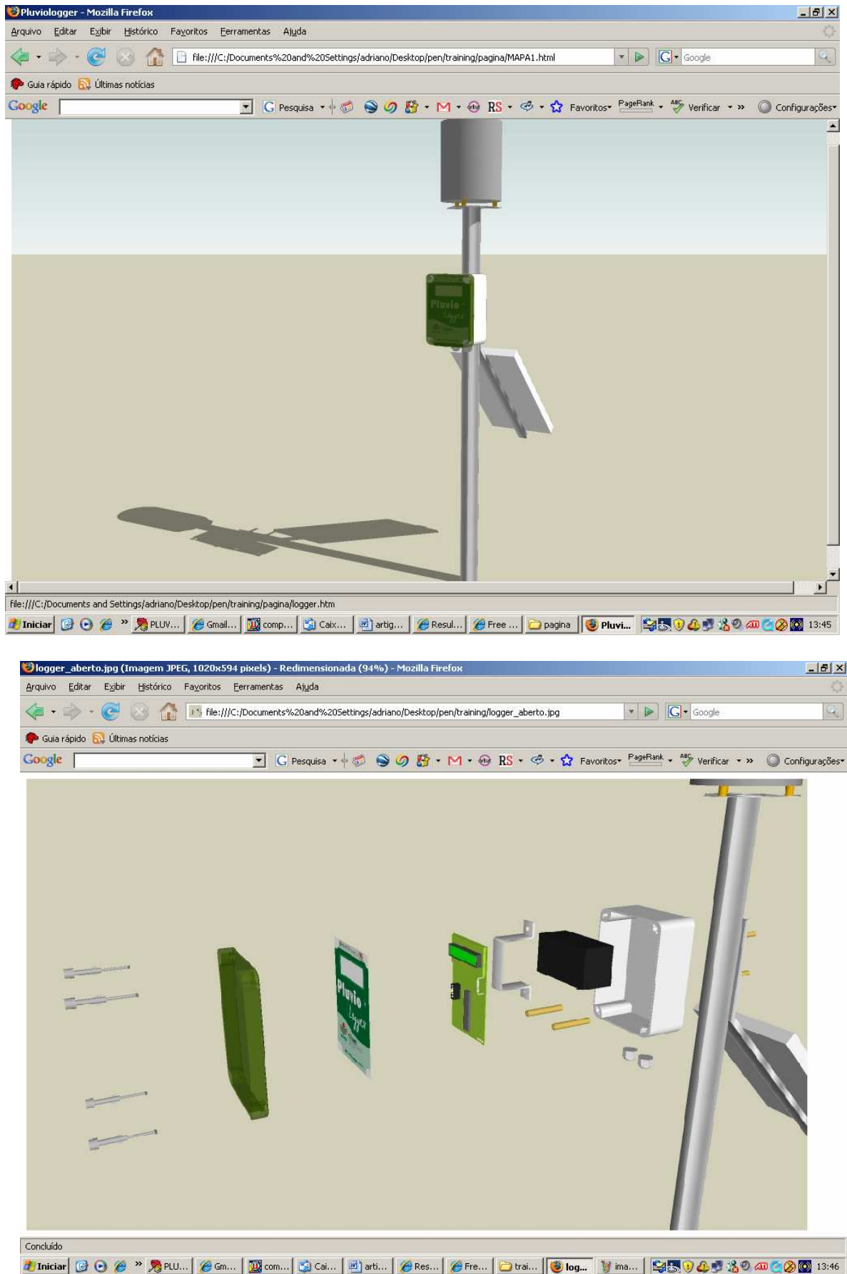
Figure 2. Storyboard of exploded view.