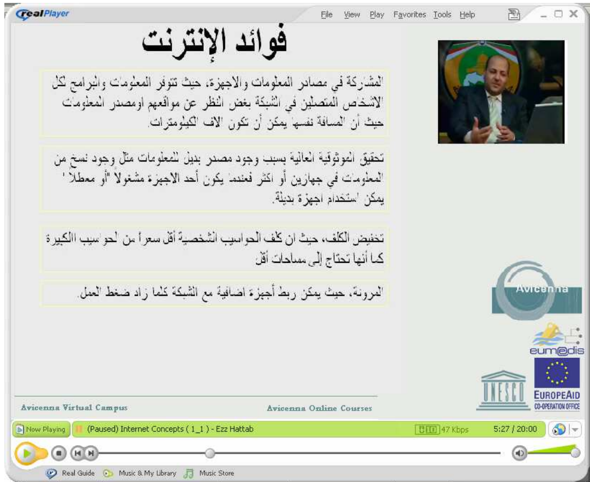
Figure 4: Regions of SMIL clip ran using RealPlayer