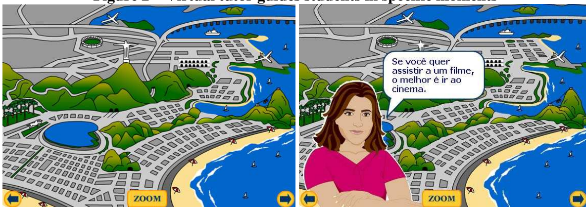
Figure 2 – Virtual tutor guides students in specific moments

The animated pedagogical agents were developed with Adobe Macromedia Flash© software and interact with students with text and audio messages in a proactive way. Besides the characters integrated in the main role-playing story, a virtual tutor guides them within the courses’ content along the scenario (Figure 2).