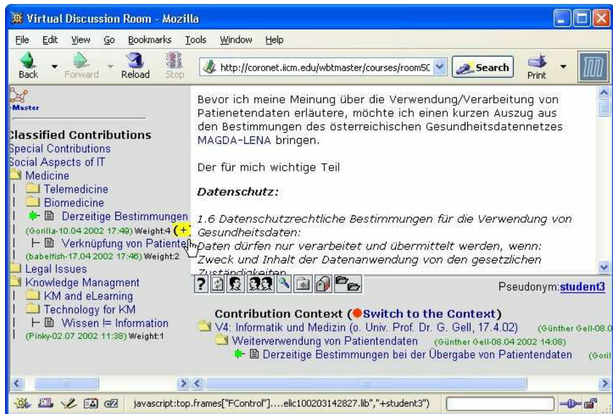
Figure 1: Voting mechanism for classification of contributions

The category structure and the contribution assignments are then utilized to improve search and navigation facilities. In addition, the predefined taxonomy might be altered on-the-fly, i.e. the taxonomy is flexible in the sense that it can be extended, the categories can be modified and deleted by the users of the system. In a sense it is a similar approach to the concept of “folksonomies” with the difference that it takes more of a top-down approach (a session is started with a predefined taxonomy) and the relations between categories are always hierarchical.