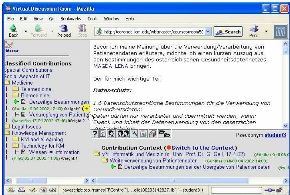
Figure 1: Voting mechanism for classification of contributions

The category structure and the contribution assignments are then utilized to improve search and navigation facilities. In addition, the predefined taxonomy might be altered on-the-fly, i.e. the taxonomy is flexible in the sense that it can be extended, the categories can be modified and deleted by the users of the system. In a sense it is a similar approach to the concept of “folksonomies” with the difference that it takes more of a top-down approach (a session is started with a predefined taxonomy) and the relations between categories are always hierarchical.