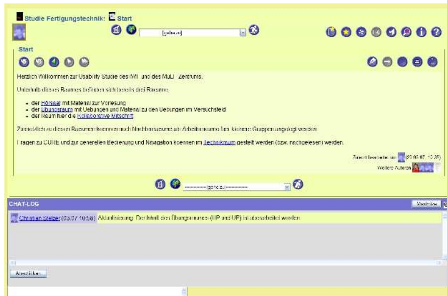
Fig. 2 Start page of the entrance room of the study

All participants were freshman students of Mechanical Engineering at the Institute for Machine Tools and Factory Management (IWF) at Technische Universität Berlin (TU Berlin). They had no previous knowledge on working within virtual cooperative knowledge spaces but had already worked at least with some classical content management systems (amongst others with Moodle[11]).