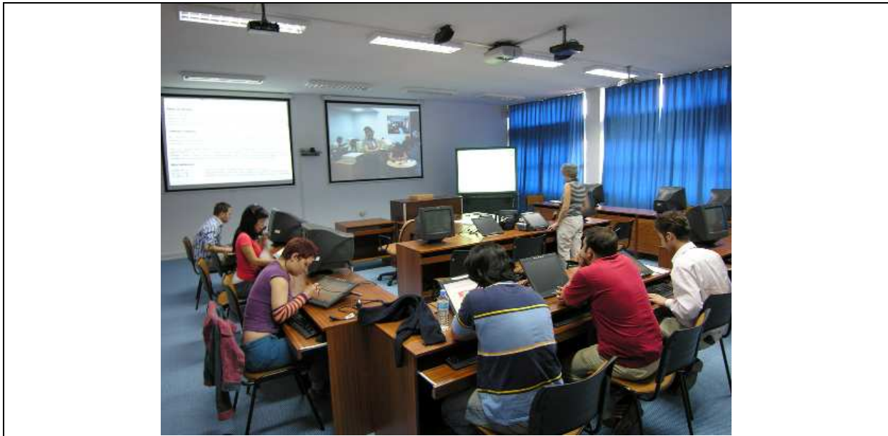
Figure 2. E-Design workshop: a synchronous design process.