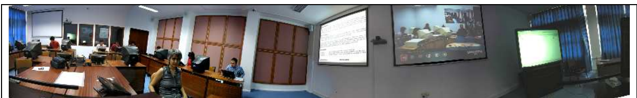
Figure 1. E-Design workshop between Faculty of Engineering and Architecture and Fine Art Faculty on May 8, 2007: figure shows the virtual studio (photographed by the author).

In order to realize this project, the course “Participatory Methods in Architecture” was carried out in virtual environment in the Department of Architecture of Anadolu University for the first time in 2005-2006 spring term. In the first phase, students were given theoretical information about information technologies and their uses as well as information about certain basic softwares such as Macromedia/Dreamweaver and Flash, Photoshop, Moviemaker, Sketch Up, Premier, CAD programs etc. Mixed project groups (Anadolu University - Istanbul Technical University - Fine ART Faculty) included one or two students from both universities. First of all each student prepared his/her own website, which gave him/her a chance to introduce his/her architectural identity to others and to gain experience in virtual environment. In the interdisciplinary team process, each member is encouraged to contribute, design and implement the group goals for the virtual project (Figure 1,2 and 3).