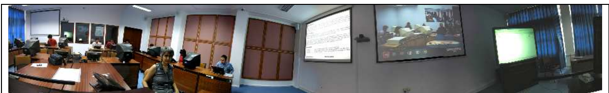
Figure 1. E-Design workshop between Faculty of Enginering and Architecture and Fine Art Faculty on May 8, 2007: figure shows the virtual studio.

In order to realize this project, the course “Participatory Methods in Architecture” was carried out in virtual environment in the Department of Architecture of Anadolu University for the first time in 2005-2006 spring term. In the first phase, students were given theoretical information about information technologies and their uses as well as information about certain basic softwares such as Macromedia/Dreamweaver and Flash, Photoshop, Moviemaker, Sketch Up, Premier, CAD programs etc. Mixed project groups (Anadolu University - Istanbul Technical University - Fine ART Faculty) included one or two students from both universities. First of all each student prepared his/her own website, which gave him/her a chance to introduce his/her architectural identity to others and to gain experience in virtual environment. In the interdisciplinary team process, each member is encouraged to contribute, design and implement the group goals for the virtual project (Figure 1,2 and 3).