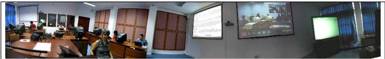
Figure 1. E-Design workshop between Faculty of Enginering and Architecture and Fine Art Faculty on May 8, 2007: figure shows the virtual studio.

In order to realize this project, the course “Participatory Methods in Architecture” was carried out in virtual environment in the Department of Architecture of Anadolu University for the first time in 2005-2006 spring term. In the first phase, students were given theoretical information about information technologies and their uses as well as information about certain basic softwares such as Macromedia/Dreamweaver and Flash, Photoshop, Moviemaker, Sketch Up, Premier, CAD programs etc. Mixed project groups (Anadolu University - Istanbul Technical University - Fine ART Faculty) included one or two students from both universities. First of all each student prepared his/her own website, which gave him/her a chance to introduce his/her architectural identity to others and to gain experience in virtual environment. In the interdisciplinary team process, each member is encouraged to contribute, design and implement the group goals for the virtual project (Figure 1,2 and 3).