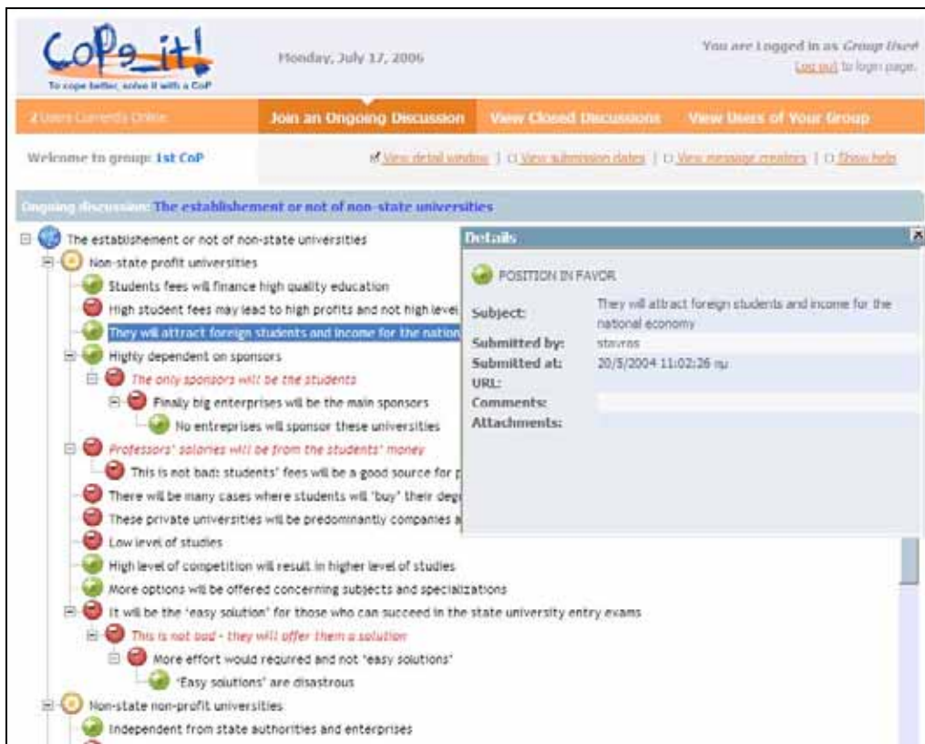
Figure 5. Viewing details of a position.