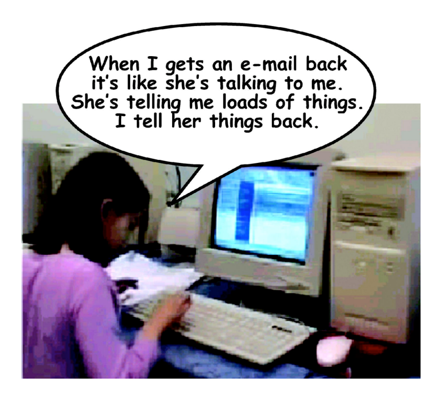
Figure 1: Annette replying to her latest email from Freya