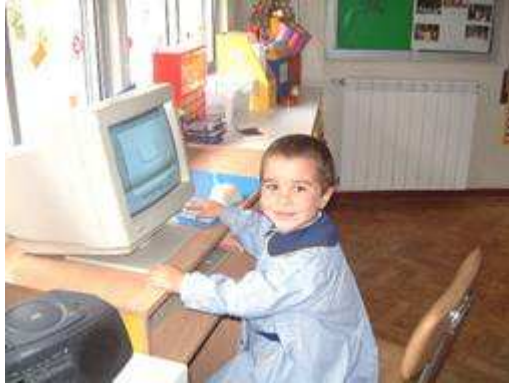
Figure 6 - Child drawing the cards at the computer