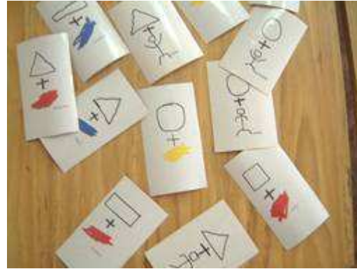
Figure 7 - Final cards

The logic blocks' pieces were scattered over a grid carpet. The children had to interpret the cards' meaning – the attributes had been randomly sampled – and then command the robot, programming it, until the matching piece was found (figure 8).