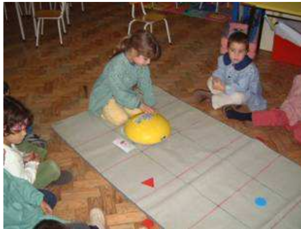
Figure 8 - Children commanding the robot

The logic blocks' pieces were scattered over a grid carpet. The children had to interpret the cards' meaning – the attributes had been randomly sampled – and then command the robot, programming it, until the matching piece was found (figure 8).