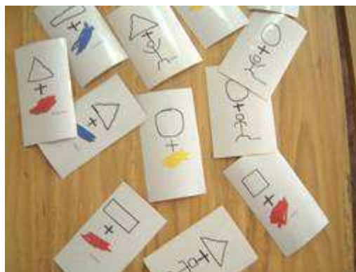
Figure 7 - Final cards

The logic blocks' pieces were scattered over a grid carpet. The children had to interpret the cards' meaning – the attributes had been randomly sampled – and then command the robot, programming it, until the matching piece was found (figure 8).