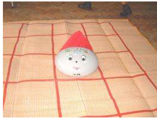
Figure 4 - Little Red Riding Hood

With this setting, Little Red Riding Hood (the Roamer robot) should take the path from its home to grandma's (math domain), going through the story events. During the retelling experience (drama and music domains: the children that wanted to watch a child operating the robot had to sing the Little Red Riding Hood song), by operating the robot, the children had to employ the notions of left/right, direction (forward/back), and quantity, to mention a few. In doing so, they were also developing a strategy to reach their goal (figure 5).