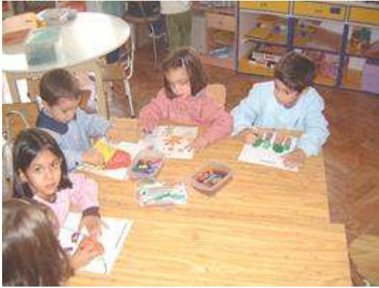
Figure 3 - Drawing the story

domain). Afterwards, the robot was disguised as Little Red Riding Hood, result is shown on figure 4 (plastic expression and drama domains).