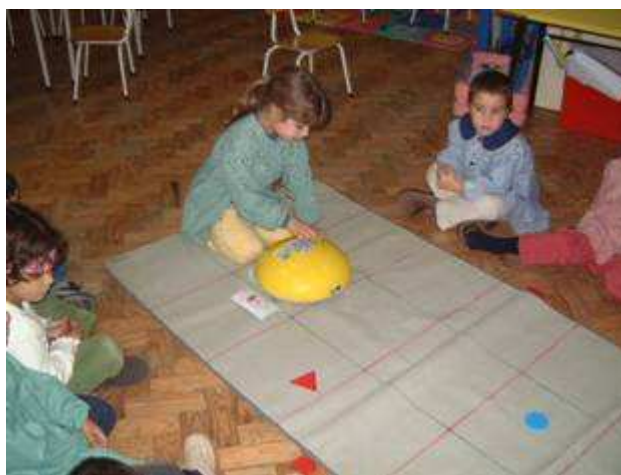
Figure 8 - Children commanding the robot

The logic blocks' pieces were scattered over a grid carpet. The children had to interpret the cards' meaning – the attributes had been randomly sampled – and then command the robot, programming it, until the matching piece was found (figure 8).