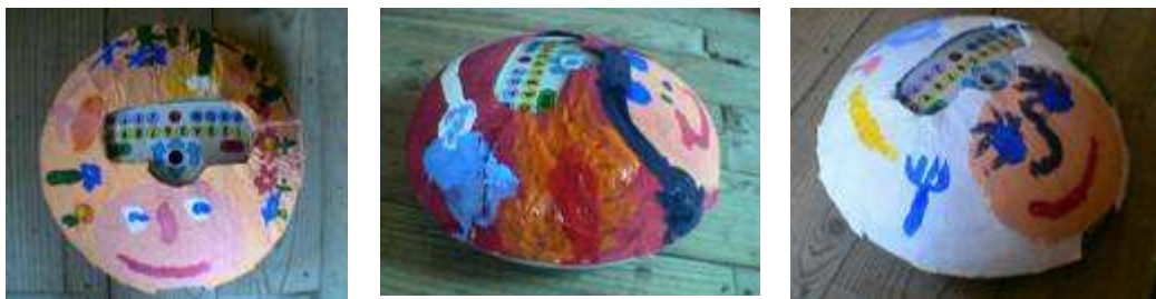
Figure 1 –Roamer robot in disguise: flower seller, firewoman and chef, for the “Professions” room project

The Roamer robot was created by Professor Tom Stonier (Goodman, 1999) at the UK. It is an autonomous, programmable toy, 40cm wide (figure 1). Its "shell" can be removed and customized, in effect acting as a "disguise" or Carnival costume. This ability is both motivational and an important element to fulfil the various individual and group projects of kindergarten rooms.