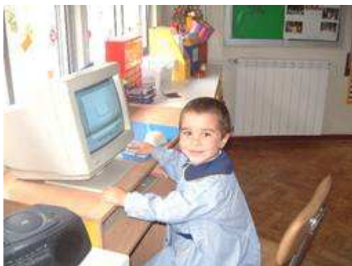
Figure 6 - Child drawing the cards at the computer