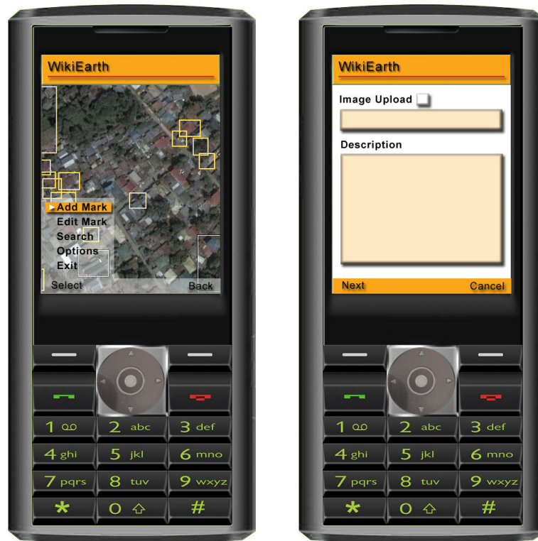
Figure 2: Mock-up examples, with the proposed front-end interface

The interface should respond to the features of the mobile device employed by the user, in order to ensure that it can run on various devices with different levels of hardware resources. The minimum equipment requirements for the front-end interface should be: ability to connect to the Internet and/or use SMS; and have enough display resolution for presenting maps. In order for the operation of wiki and map servers to be independent of actual mobile devices, an interposing software layer must be developed (“Interface Layer”), with components adapted to each kind of device. Its function is to convert requests native to each device into generic request, which will then be interpreted by the servers. We also propose that data communication between all system components is performed, as much as possible, with standard XML-encoded data.