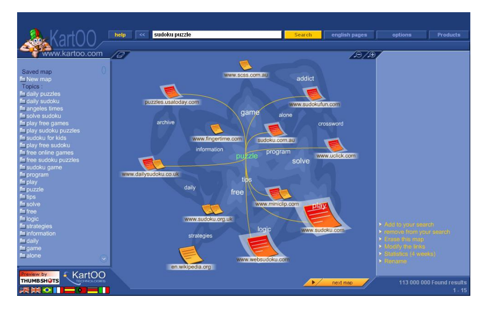
FIGURE 1. SCREENSHOT FROM THE TASK3 (SEARCH RESULTS WITH THE KEYWORD SUDOKU)