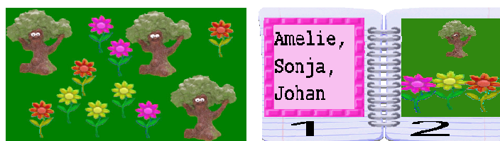
Figure 4. On the left it is possible to see the garden defined by Jeka’s team, while on the right it is possible to see the attempt of guess sent by a Swedish team.

After some reflections and discussions, the girls decide to publish the garden they had produced, made of 3 objects of each kind (Figure 4). They believe that their opponents may think that the garden is made of 1 object (or 2 objects) of each kind.