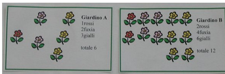
Figure 6. On the right: Lollo’s team’s garden; on the left Jeka’s team’s garden.

After responding to their Swedish pals, the Italian pupils are required to discuss how to respond to M’s challenge. Such challenge is analysed by two teams who obtain the graph of Figure 5 using the Bar Graph tool.