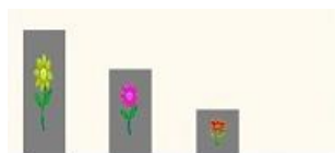
Figure 5. The results of 1200 extractions from M’s challenge.

The following week the class goes back in the computer laboratory and each team finds an answer from a Swedish team. Jeka’s team finds the answer given by Amelie’s team (Figure 4), who conjectured that the garden contained 1 object for each kind, instead of 3, as expected by Jeka’s team. The answer is considered wrong by Jeka’s team, as they write in the message they send to the Swedish opponents.