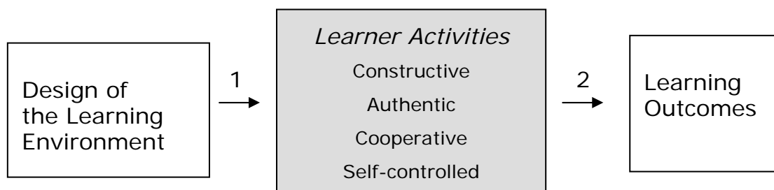
Figure 1: A macro-analysis of learner activities

The basic concept of powerful learning environments seems to be based on two fundamental assumptions that are illustrated in Figure 1. The first assumption is that providing an appropriately designed learning environment will afford constructive, authentic, cooperative, and self-controlled learner activities (arrow 1). The second assumption claims that learner activities which satisfy these specifications of constructivist learning will lead to positive learning outcomes (arrow 2).