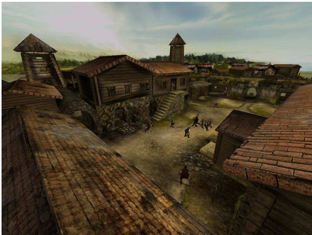
Figure 3. Bird's eye view of the area surrounding the Castle of Oulu

New teaching programs often emphasize community, the importance of communication, and media skills. The game showed potential for the realization of precisely such objectives.