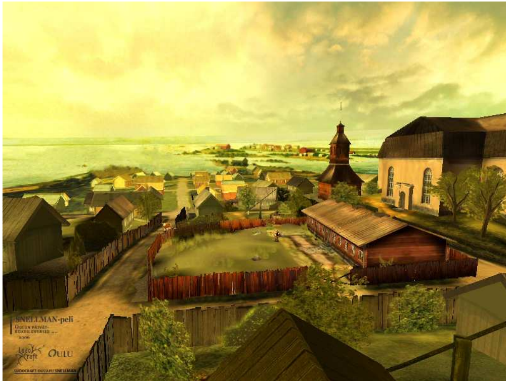
Figure 4. A street scene from Snellman's period and game environment

The central idea behind Virtual Snellman is to create a virtual learning environment that contains a wealth of information about Snellman and his contemporaries, and to transport the player into their historical surroundings. The learning environment will also contain exciting game-elements such as various objectives and goals, role-playing and colourful characters, and an exciting plot. Students will be able to develop strategic thinking as well as problem solving and decision making skills. Furthermore, the learning environment will enable the student to be a part of a group and interact with his or her social network.