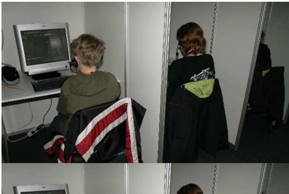
Figure 5. Gamers in action

Games present a difficult situation for teachers and parents. Due to the fast pace of modern culture, teachers and parents find it difficult to keep up with progress. Teachers and schools can no longer view themselves simply as distributors of information. The focus of education is shifting towards the task of understanding a computerized digital world that contains great amounts of noisy information. Active learning such as this produces a learning experience that the student will remember for a very long time. Learning, in this sense, consists to a large extent of adapting and processing information to suit a great variety of different contexts. Experience has shown that young students are drawn to game-like learning environments and find in them the necessary motivation to undertake the study of a given subject. Retrieving strategically placed bits of information produces a clear picture of the subject as a whole, provides an enjoyable gaming experience, and, most importantly, inspires learning.